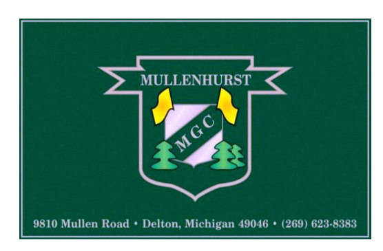
Present the Annual Orangeville Charity Golf Scramble Saturday July 31, 2021 8:00 AM